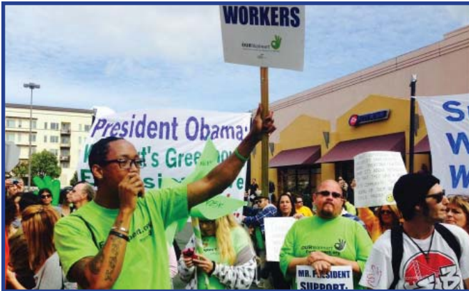
Members of OUR Walmart join community supporters and environmental activists to call on President Obama to tell Walmart to improve jobs and take real steps to protect the environment.

Responding to President Obama's call to address the income inequality that he said was the "defining challenge of our time," Walmart workers, elected officials, faith leaders, and prominent environmental and advocacy groups are calling on the president to challenge Walmart to take real steps to improve jobs and protect the environment. The wave of calls for change comes after the president visited a Walmart store in Mountain View, Calif., on Friday where hundreds of people, including members of OUR Walmart and UFCW Locals 5, 8, and 648 rallied and asked him to challenge the low-wage employer to improve jobs.