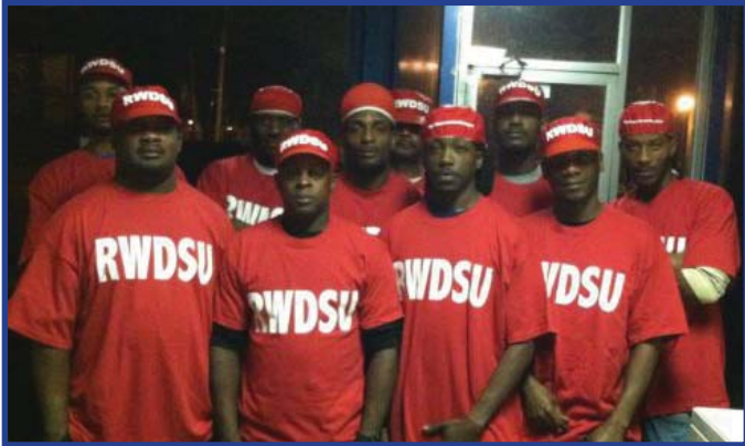
Sanitation workers at a Tyson poultry plant came together to join RWDSU Southeast Council to have a union voice like the RWDSU members who currently process poultry in the same plant.

The poultry processing workers at the Tyson plant are already members of the RWDSU and played a critical role in assisting QSI Contract Sanitation workers win a union voice. After speaking with their RWDSU co-workers, QSI workers realized the only way they could resolve the lack of a grievance procedure and improve their jobs was by joining a union and negotiating a union contract.