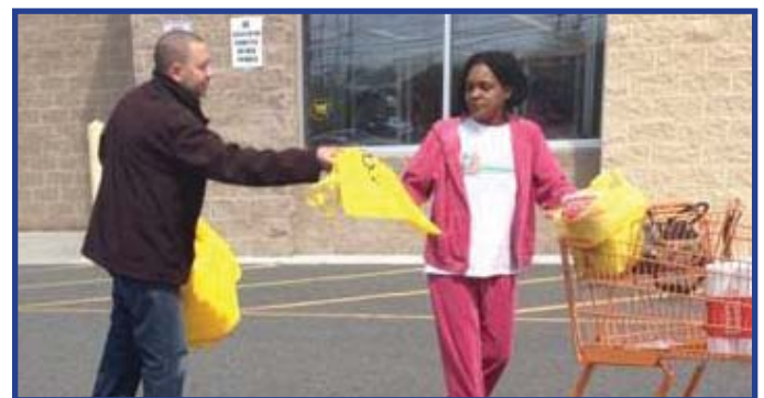
UFCW local 152 and 1360 members held a grocery bag action to show support for Bottom Dollar grocery workers as they work toward having a union voice on the job.

Members of UFCW Locals 152 and 1360 showed support for Bottom Dollar Grocery workers and their efforts to have a union voice on the job. Workers at Bottom Dollar do not have a union and workers have reached out expressing interest in joining the UFCW.