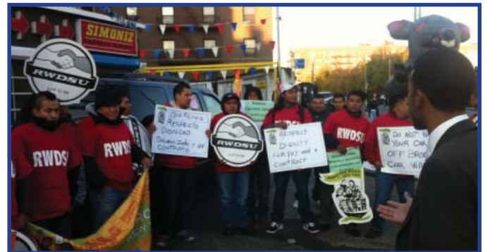
Car wash workers in New York City when on strike in protest of the store owner refusing to recognize their efforts to join the RWDSU.

Workers at Off-Broadway Car Wash in Queens, New York, walked off the job last week to demand that the owner recognize their efforts to join a union. The owner has been avoiding the efforts of the NLRB to set up an election despite a government subpoena being issued.