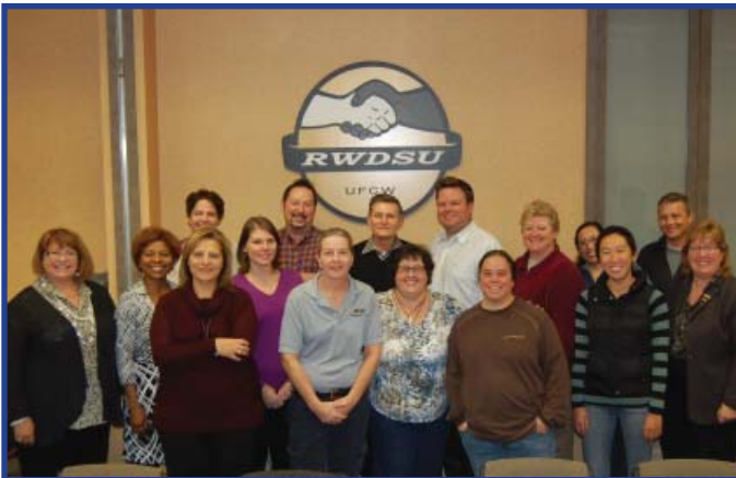
Members of the UFCW OUTreach Executive Board convene their first meeting hosted by RWDSU-UFCW in New York.

Last week, OUTreach, the UFCW's new LGBT constituency group, held its first board meeting at the headquarters of the RWDSU in New York City. Board members from Los Angeles, Toronto, Houston, Seattle, St. Louis, Philadelphia, and elsewhere were in attendance.