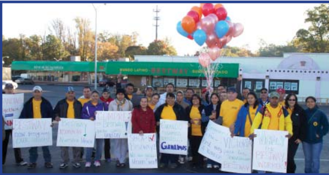
Bestway grocery workers in Virginia went back to work after being illegally fired in retaliation for forming a union.

On Monday, 31 workers at a Bestway supermarket in Falls Church, Virginia, went back to work after being illegally fired in retaliation for forming a union. The workers picketed their store for more than ten days before reaching an agreement with Bestway last week to reinstate the workers and begin negotiations for their first union contract.