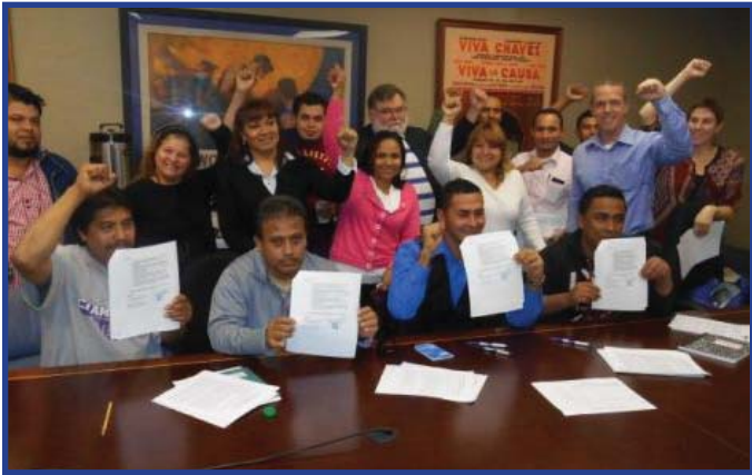
RWDSU Workers at four car washes across New York City ratified their first contracts.

Starting next year, workers will get five paid days off per year and two personal days, in addition to the right to take family leave and to attend to immigration issues.