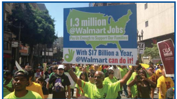
Congressional leaders will hold a forum with Walmart workers to discuss the impact of Walmart's low-wage work on the economy.

Congressional leaders from across the country will hold a congressional forum on Walmart jobs tomorrow. Rep. George Miller (CA-11), Rep. Jan Schakowsky (IL-9), and Rep. Alan Grayson (FL-9) will join members of OUR Walmart to discuss the larger implications of Walmart’s low-wage work on the federal budget and national economy. The forum will also address calls on the company to pay a minimum of $25,000 a year, stop retaliation against those who speak out, and provide more full-time work.