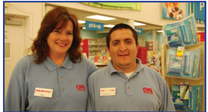
Hundreds of CVS workers across the Los Angeles area have voted to join UFCW Local 770.

In May this year, workers at 24 CVS stores across Los Angeles joined the UFCW this year as part of an unprecedented cooperation agreement between CVS Caremark and the UFCW. Since May, hundreds more workers at Los Angeles area CVS stores stood together and joined UFCW Local 770, bringing the total number of newly unionized stores to 50 and more than doubling the number of new stores under contract. These workers join more than 8,000 CVS workers in 11 states and the District of Columbia who are already members of the UFCW.