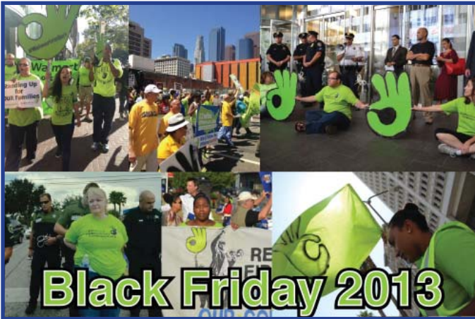
The OUR Walmart team celebrates a legal victory in Washington and prepares for actions leading up to Black Friday.

In response to last year's Black Friday actions, Walmart filed a lawsuit in Washington state court against OUR Walmart and the UFCW alleging trespass and requesting a court order to prohibit future OUR Walmart actions inside and outside of Walmart stores.