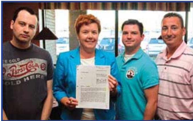
UFCW Local 832 members have ratified the first union contract with Staples in North America.

Staples workers in Winnipeg, Canada have unanimously ratified their first contract with the company. This is the first-ever union agreement with Staples in North America. Workers are members of UFCW Local 832.