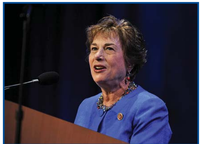
“I am here today to tell you we can rebuild the American Dream for everyone,” Rep. Jan Schakowsky (IL-9).