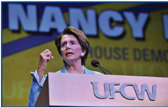
“We must fix the growing income gap, which is undermining the middle class,” Rep. Nancy Pelosi (CA-12).