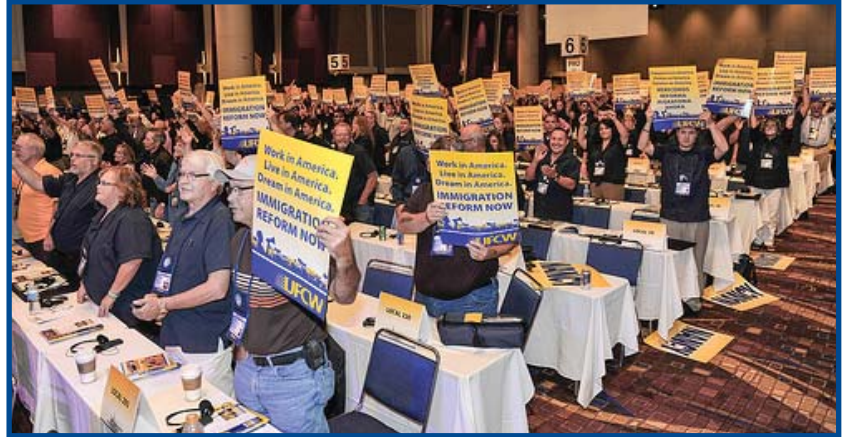
UFCW delegates declare that the "Time is Now!" for comprehensive immigration reform.