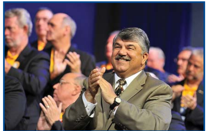
"Proud, honored and humbled to be with UFCW brothers and sisters today in Chicago," AFL-CIO President Richard Trumka.