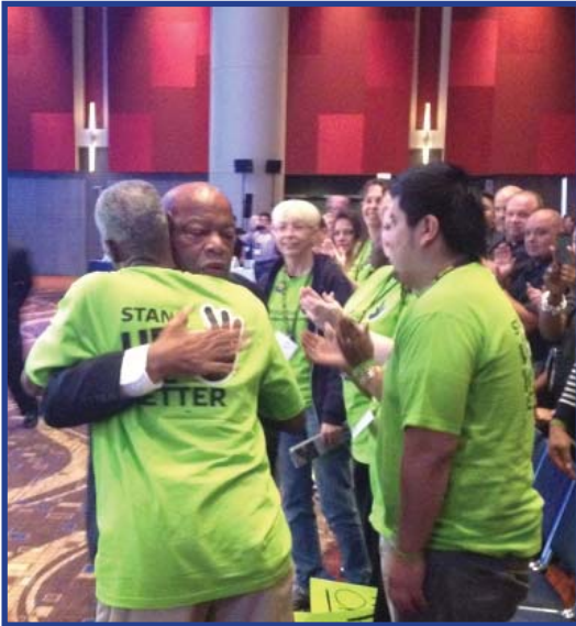
Rep. John Lewis (GA-5) greets OUR Walmart members at the convention.