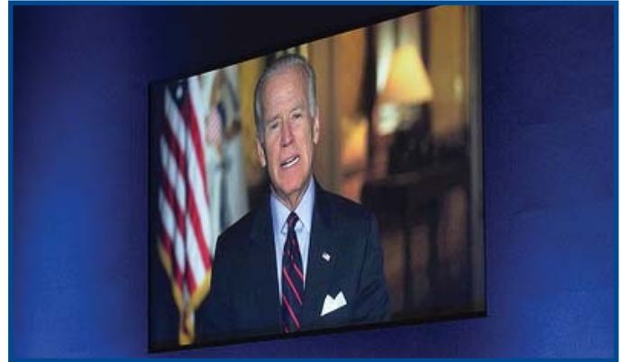
Vice President Joe Biden delivers a message from Washington, D.C. to the delegates in Chicago.