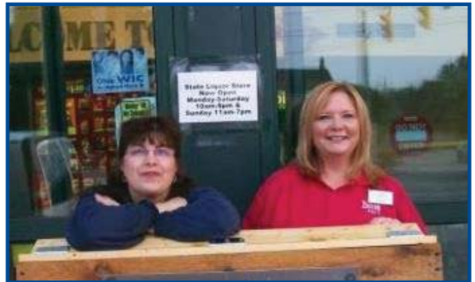
One of the winning photos from the UFCW Union Made Facebook Contest.

The winners have been selected for the UFCW Union Made Facebook contest. Earlier this year, UFCW launched a photo contest to highlight UFCW made products and members at work. Members were asked to post pictures of themselves or their co-workers or other members—on the job or with the products we make on the Facebook app. Winners will be contacted about their prizes shortly and the winning pictures will be posted soon.