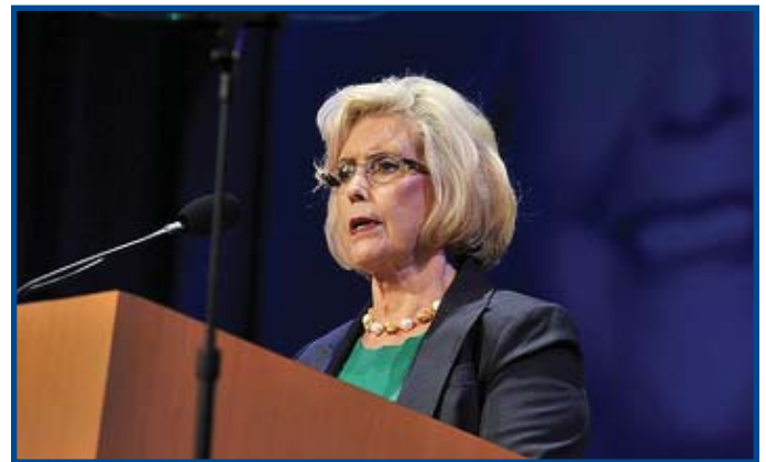
Women’s equality and worker activist Lilly Ledbetter addresses delegates at the Convention, “There is so much injustice, so there is so much work to be done.”