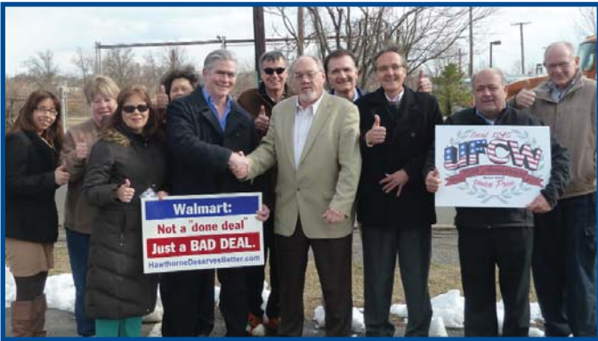
Members from UFCW Local 1245 and community leaders celebrate their successful campaign to keep a Walmart from being built.

Members then joined community groups and canvassed local neighborhoods to distribute door hangers to residents asking them to support local businesses and good jobs by keeping Walmart out of the area.