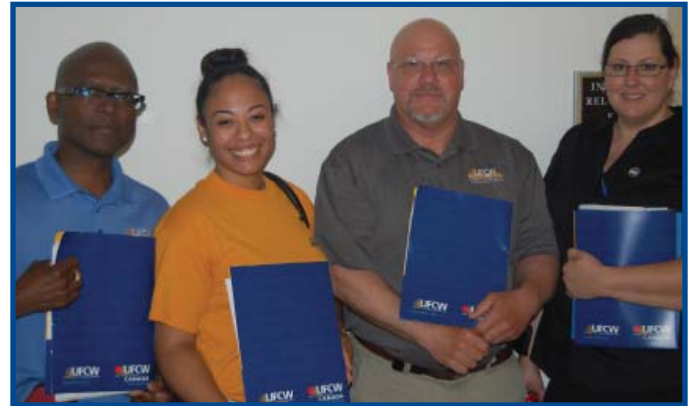
Over 150 UFCW members participated in the National Lobby Day in Washington, D.C. to talk about fixing the ACA and passing comprehensive immigration reform.

The day started with an address from Congressman George Miller of California, the top Democrat on the House Education and the Workforce Committee. He spoke to Lobby Day attendees about the ongoing attack on workers and stressed the importance of speaking out on Capitol Hill.