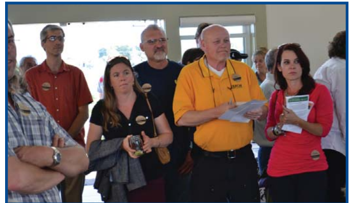
The delegation from the UFCW International and UFCW Locals 5 and 8 attend the launch of Citizens for Responsible Access.

UFCW Locals 5, 8, and the UFCW's National Medical Cannabis and Hemp Division joined with labor, community, political and business allies to launch a new political action group, "Citizens for Responsible Access," (CRA) in California last week. CRA advocates for the implementation and enforcement of cannabis policy that supports the environment, public safety, fiscal responsibility, and the rights of all people to fair treatment under state and local law.