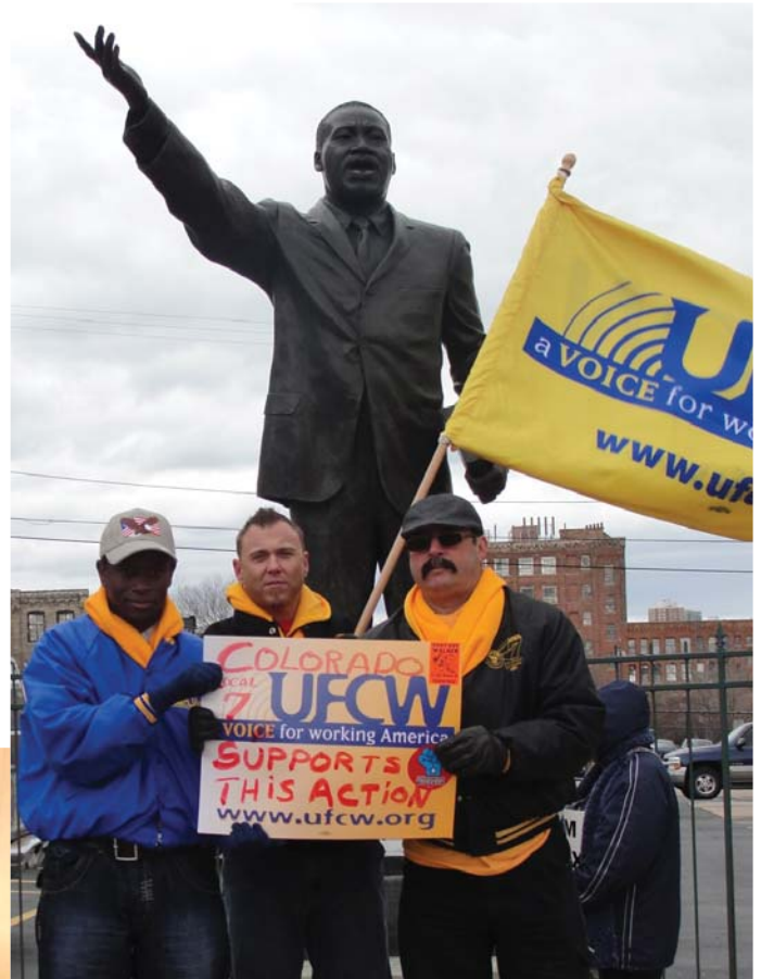
Clockwise from top right: Local 7 in Colorado shows solidarity with Wisconsin workers; UFCW members in Wisconsin continue to stand strong; UFCW members rally in Texas with community members and other union members; Local 1995 workers joined thousands of UFCW members around the country in wearing solidarity stickers to work.

The response from UFCW Locals across the country was overwhelming. Eighty-two local unions organized over 150 activities and it is impossible to feature all of the events that took place, but we will be adding more photos to the UFCW photostream online at http://www.flickr.com/photos/ufcwinternational/show/ OP