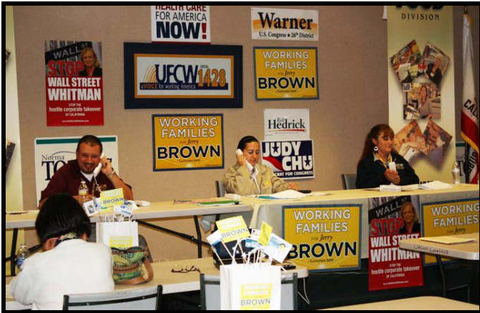
Local 1428's member-driven phone banks are part of the reason Jerry Brown and Barbara Boxer are moving ahead in the pre-election polls.