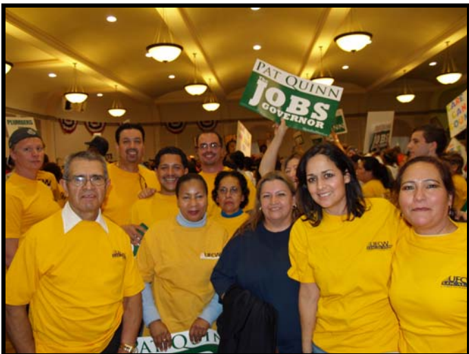
Local 1546 members are turning out the vote for Illinois Governor Pat Quinn.

The photos on this page are just a small sample of UFCW members in action around the country. Share your UFCW gold people power pictures by sending them to NewsService@ufcw.org and view a full slideshow at www.voteufcw.org OP