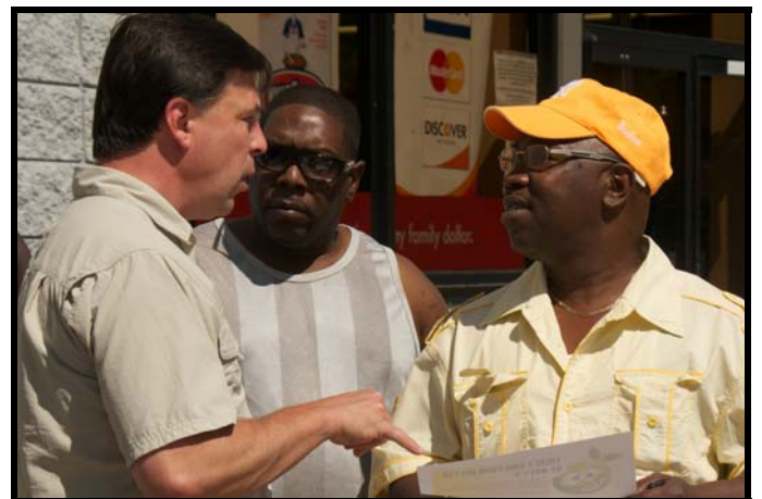
Local 1459 tells local shoppers about the Williamson strike.

Locals who have participated in Mott's actions include 2, 5, 7R, 21, 22, 23, 27, 38, 75, 88, 99, 135, 152, 227, 271, 304A, 328, 367, 400, 431, 455, 464A, 534, 536, 538, 540, 648, 653, 655, 700, 711, 770, 789, 876, 880, 881, 951, 1000, 1059, 1116, 1167, 1208, 1262, 1360, 1439, 1442, 1459, 1473, 1529, 1546, 1564, 1625, 1657, 1776, 1995, 1996, and 2008.