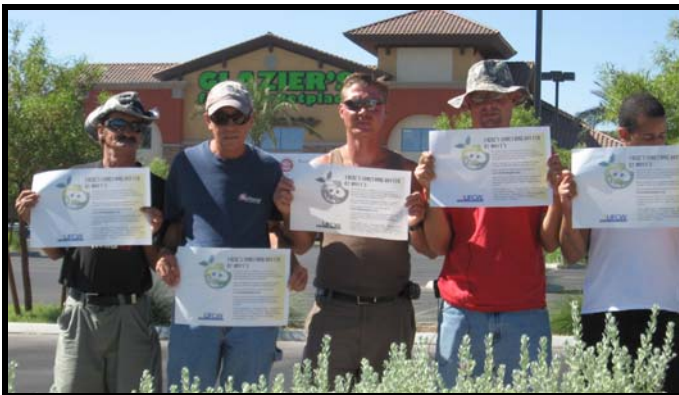
Local 711 members inform consumers about the Mott's strike outside a Las Vegas supermarket.

UFCW members have distributed flyers at supermarkets and discounters, written letters to the editor and informed consumers about the Mott's greed and their parent company, Dr Pepper Snapple Group.