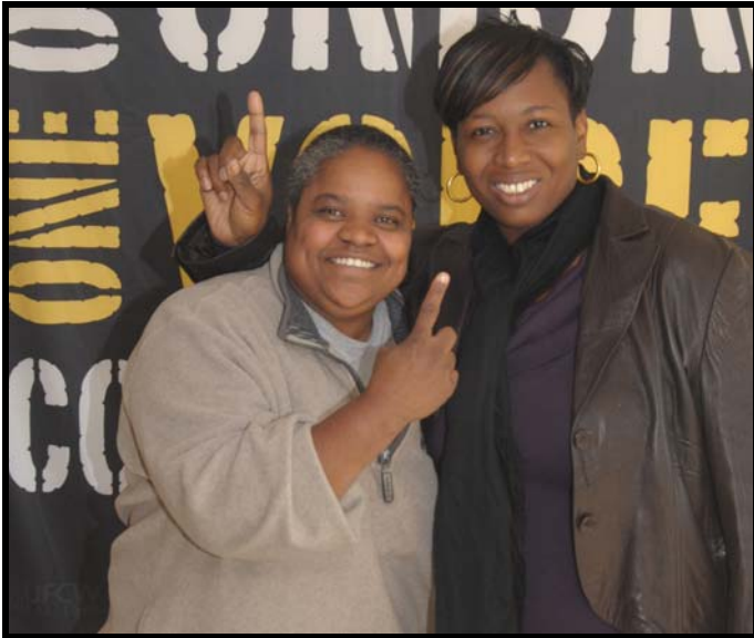
Local 1500 bargaining committee members celebrate their new contract.

More than 16,000 members of Local 1500 that work at Stop & Shop, Pathmark and King Kullen supermarkets ratified a new contract with their employers on July 8.