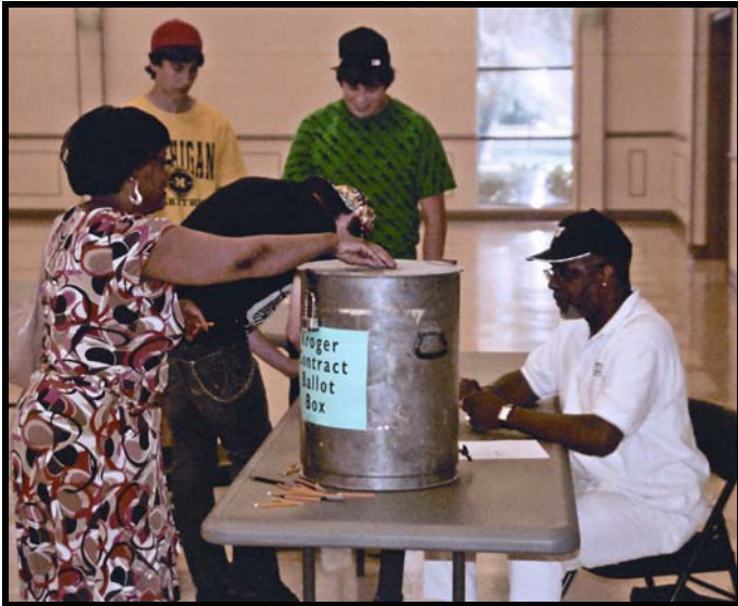
Local 876 members vote to ratify their new contract with Kroger.

Members of Local 876 in Michigan have ratified a new three-year contract with Kroger. The contract covers around 12,000 members at more than 100 Kroger stores.