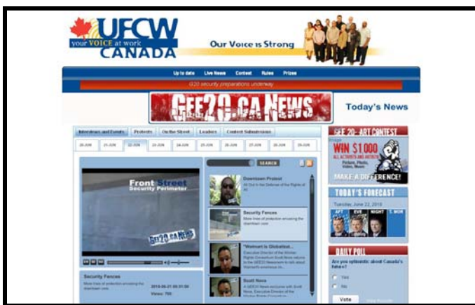
UFCW Canada's Gee20.ca website

UFCW members can follow the summit live at www.gee20.ca and are encouraged to participate in the site's discussions. OP