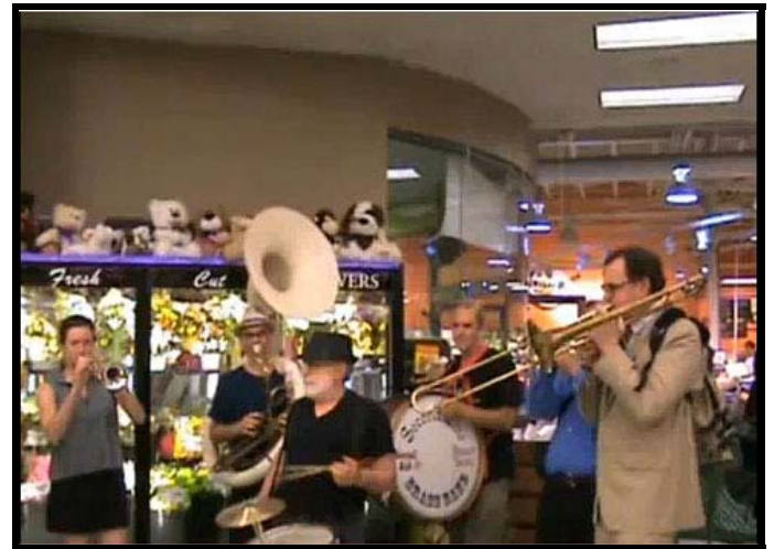
A still from the video of the Shaw's flash mob action

UFCW members, Massachusetts Jobs with Justice activists and community allies grabbed attention with a "flash mob" protest in a Massachusetts Shaw's store. The protest was organized to draw attention to the fight for justice by members of Local 791 who work in Shaw's Methuen distribution center and have been on strike since March 7 for affordable health care for their families.