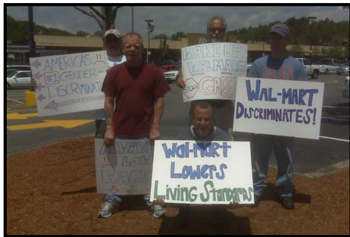
Local 1445 members show off their handmade signs outside Walmart in Salem, Massachusetts.

Other participating locals included Local 464A in Saddle Brook, N.J.; Local 1 in Buffalo, N.Y.; Local 1445 in Salem, Mass.; Local 919 in Hartford, Conn.; Local 1657 in Birmingham, Ala.; Local 1996 in Duluth, Ga.; Local 880 in and around the Cleveland, Ohio area; Local 770 in Indianapolis, Ind.; Local 1059 in Columbus, Ohio; Local 789 in St. Paul, Minn.; Local 367 in Takoma, Wash.; Local 1496 in Anchorage, Alaska; Local 711 in Las Vegas, Nev.; Local 1442 in Torrance, Calif.; Local 770 in Camarillo, Calif. and Local 135 in San Diego, California. OP