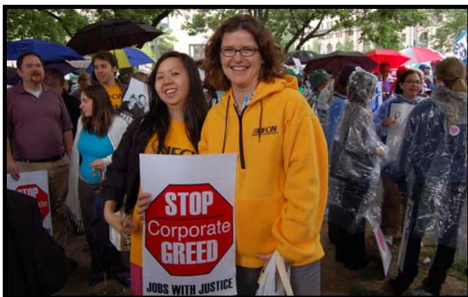
Above, UFCW members protest Wall Street greed in a rally on K Street. Below, posing as "Billionaires for Wealthcare", UFCW members urge Congress to pass stricter financial regulations.

The marchers went down K Street, home to many of the large corporate lobbying firms working to influence Congress to weaken proposed financial regulations. To learn more about these issues and get involved, visit OurFinancialSecurity.org . OP